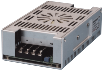
3"W x 5"L x 1.7"H